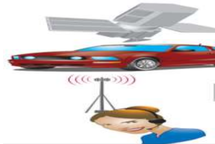
Figure 1: Process Flow of Existing System “Accident notification system”